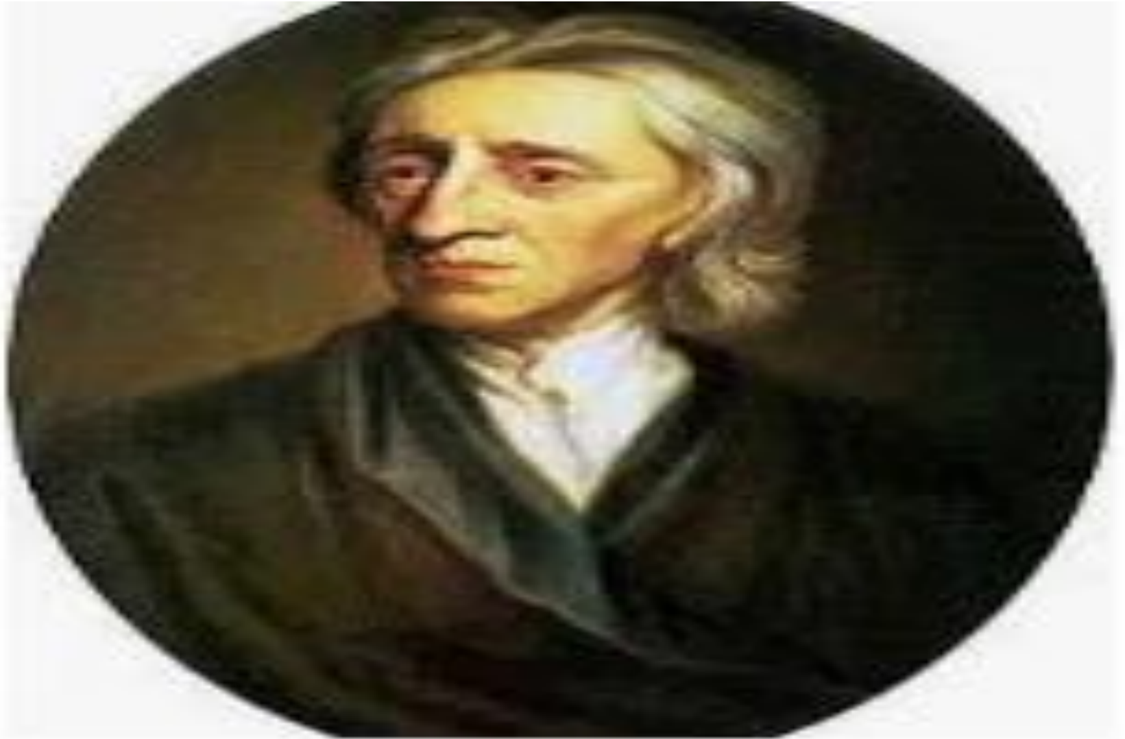
John Lyly (1554-1606) —